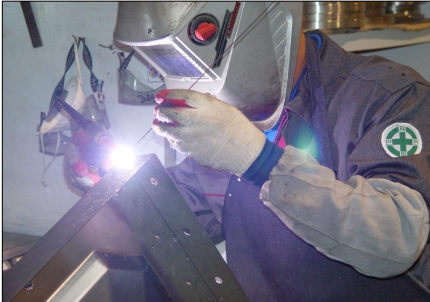
Welding of Panel Conner – 1