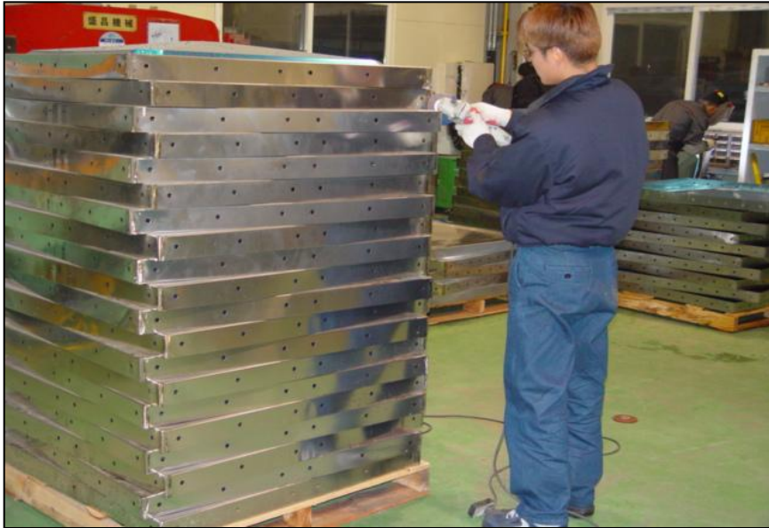
Welding Portion it Trims -1